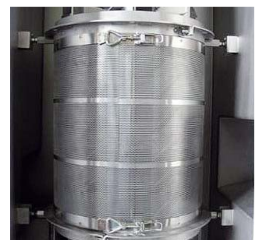
Easy Mount (EM) Screen

The perforated dryer screens have been improved to be more operator friendly and easier to assemble and disassemble by using belt straps around the screens. These new Easy Mount (EM) screens are available for any application, up to 16 Series dryer, requiring frequent cleaning, as well as heavy-wear applications, such as underwater pelletizing and drying of glass-fiber-filled compounds. These screens are being utilized in field operations in various applications and have proven to be leak free, fast to install and remove, and easy to clean.