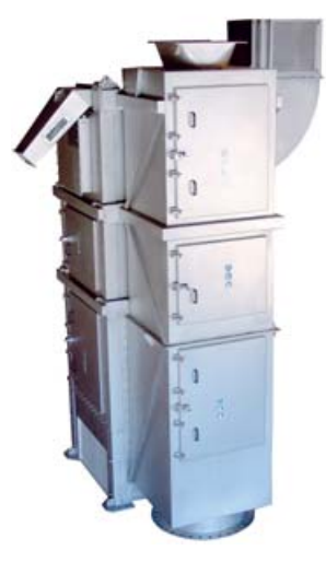
Model 100 High Capacity Dryer