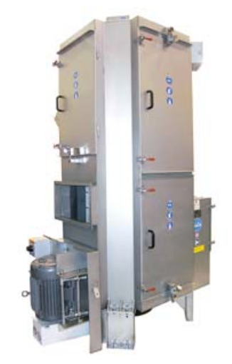
Easy access system

Production Rate: up to 50,000 kg/h – With the EASY ACCESS series dryer, Gala offers wide doors which permit easy, fast and safe access for internal cleaning and maintenance. All Gala dryers are supplied with door-timed interlocks and/or local power disconnect for operator safety.