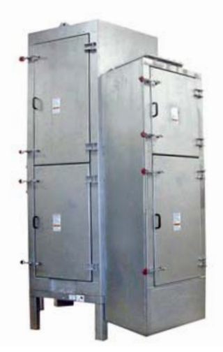
Model 48.5 DW ECLN Dryer