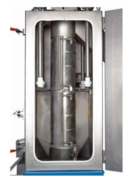
Model 2008 Self-Cleaning Dryer