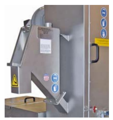
Model 4 Manually Operated Agglomerate Catcher