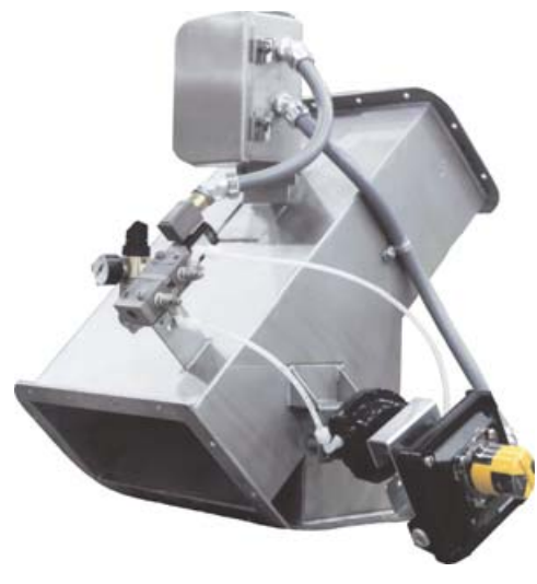
Pneumatically Actuated Pellet Diverter Valve

HMA Rotor: designed specifically for hot-melt adhesives or tacky product applications