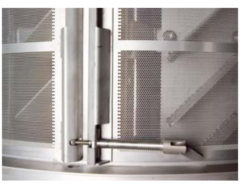
Perforated Screen used for most dryer applications

The screens are an integral part of the centrifugal dryer and serve to retain the pellets in the rotor area as they travel up the rotor to the resin outlet. The surface moisture escapes through the screen openings and drains back into the process water tank. The type of screen used depends on the product and specifications – from the typical perforated screens used for most applications to special-application screens such as Wedgewire for added strength and durability or Expando and ML (multilayer) screens primarily used for micropellet production.