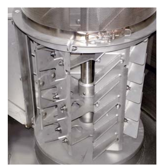
Rotor area of a 2016 BF Dryer